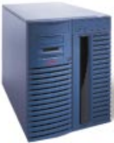
Compaq AlphaServer DS20 System

And what does this added power and performance from Compaq really mean to you? They mean you can expect a 200% – perhaps even a 300% – boost in the performance of your most demanding applications.